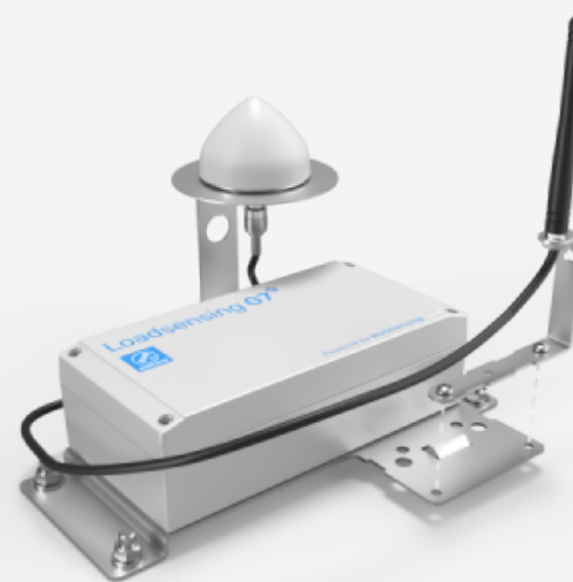
Fig. 4: Compact horizontal mount. Use the LS-ACC-BIG-HVP versatile mount plate to secure the device to a horizontal surface. Attach the LS-ACC-ANT-HVP versatile mount plate for the GNSS antenna to the node mount plate for a compact setup. Use the LS-ACC-ANT-LORA versatile LoRa mount plate and the LS-ACC-ANTS-G7 cable extension to position the LoRa antenna vertically.