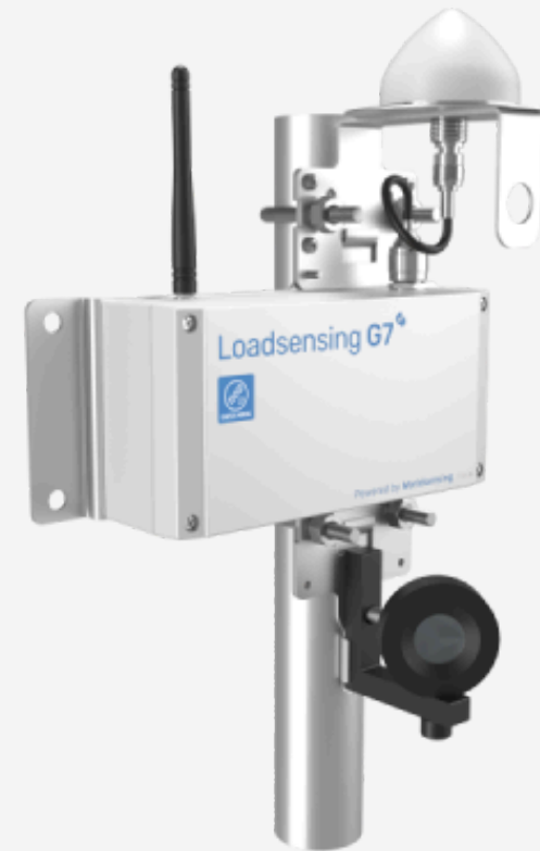
Fig. 2: Compact mount with u-bolts. Use the LS-ACC-BIG-HVP versatile mount plate and WS-ACC-U50 50mm U-bolts to secure the device to a 50mm pole. Attach the LS-ACC-ANT-HVP versatile mount plate for the GNSS antenna to the node mount plate for a compact setup. Add the LS-ACC-PRS-VP prism mount plate for prism installation. Not recommended for base stations.