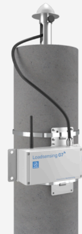
Fig. 3: Survey pole mount. Use the LS-ACC-BIG-HVP versatile mount plate to secure the device to a pole with metal clamps. Install the GNSS antenna on top of the pole using the LS-ACC-GNSS-RD 5/8-inch survey pole mount and the LS-ACC-GNSS-CL2 or LS-ACC-GNSS-CL3 cable extension. Suitable for base stations and rovers.