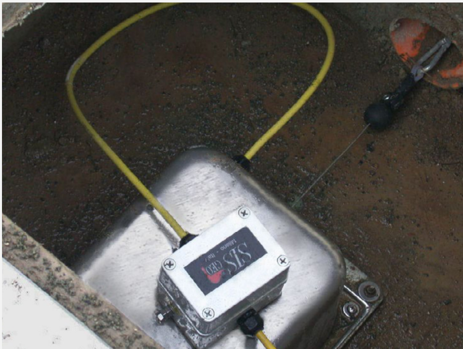
Wire crackmeter installed in a manhole with over voltage protection box

IP65 plastic junction box with tripolar over voltage protections for instruments up to 4 wires. Over voltage protection must be connected to earth ground.